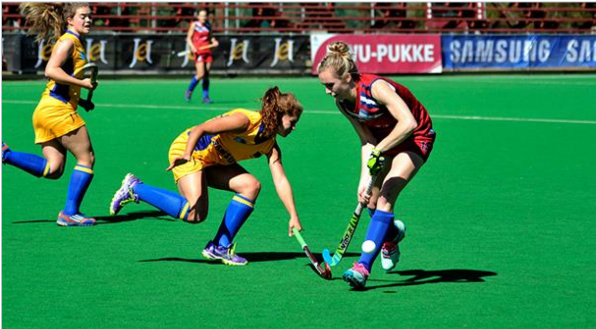
Sun 03 May 2015. Potchefstroom Hockey Field, North West. KOVSIES vs WITS.

Women's Varsity Hockey is the big deal this May, and not just because our 1st X1's one of only 8 'varsities competing in this prestigious tournament.