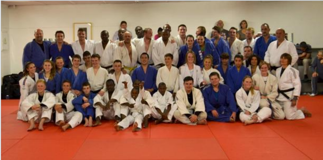
The WKC training squad, pictured here on 29 April 2015

The start of the year for Wits Judo has been phenomenal, kicking off with the 2015 USSA championships hosted by the University of Pretoria.