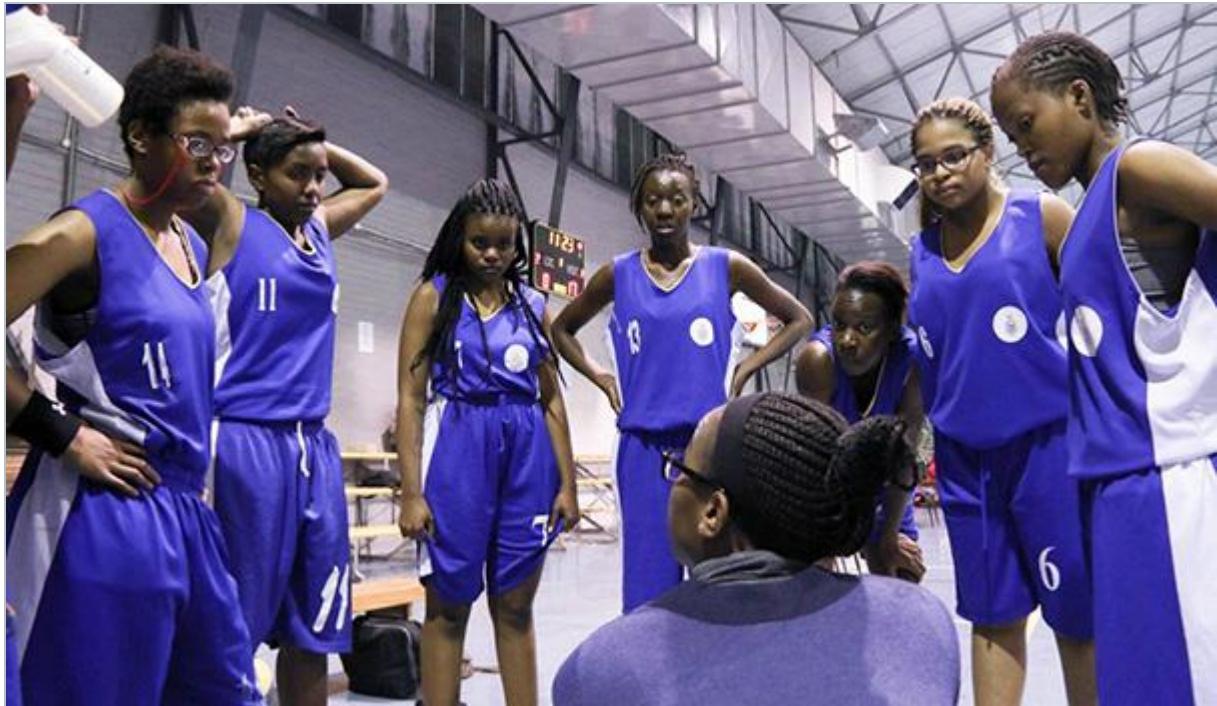
Wits lady Bucks catch their breath during a break in their game against Soweto Raptors at the this year's Ashie's tournament.

The 11th annual Ashies, the Ashraf Lodewyk Memorial Basketball Tournament, hosted by Wits Basketball between 22-27 April, has come and gone.